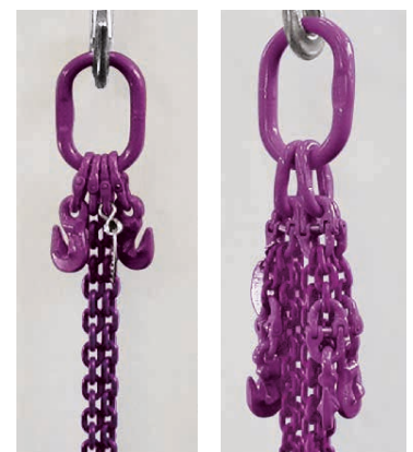
4-leg chain sling